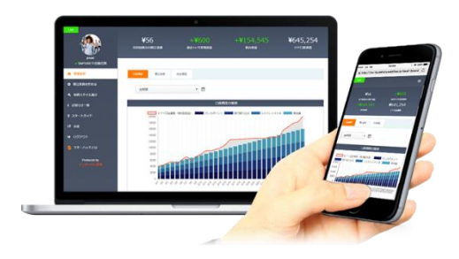
Money Hatch screen